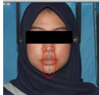
Figure 6. Both anatomical points were marked