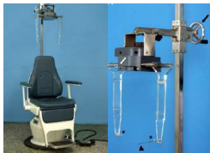
Figure 8. Sefalostat. 16